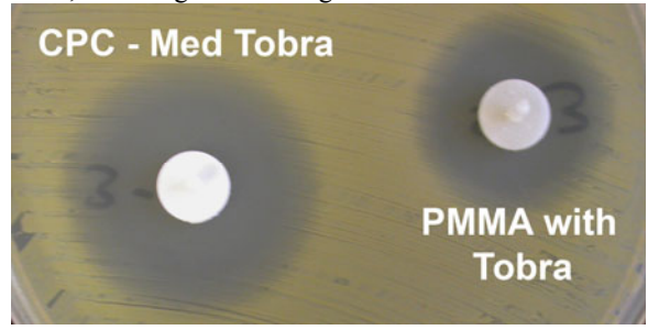
Figure 1. CPC + medium dose Tobra and Simplex + tobra

model<sup>4</sup>. Including tobramycin with the standard CPC composition resulted in a more fluid paste than CPC without tobramycin. Some of the CPC disks made with the high level of tobramycin did not stay intact during removal from the mold, but still generated large zones of inhibition.