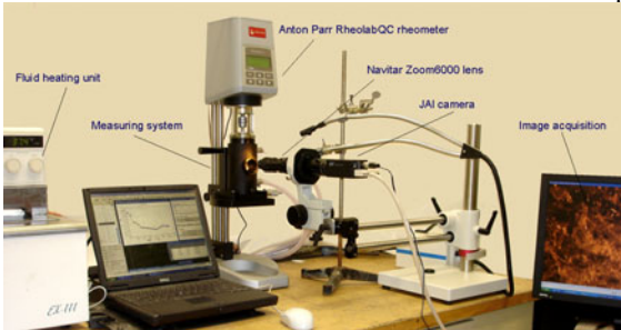
Figure 1. Photograph of the optical/rheometrical platform.

Methods: The rheometer (Anton-Parr, RheolabQC) shown in Fig. 1, based on concentric cylinders induces sheer in the fluid filling narrow gap between the rotating spindle and the outer glass cylinder. The outer jacket insures a controlled temperature and allows visual inspection of the biomaterial. The samples are supported on the middle spindle.