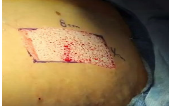
Figure 1: Donor site wound after split-thickness skin graft (STSG) is harvested from a patient's thigh.

Introduction: Split-thickness skin grafting (STSG) is a common reconstructive surgical procedure for the management of patients with deep second and third degree burns. STSG requires the creation of a donor site, from which a thin slice of epidermis and dermis are harvested for transplantation to the burned area. Management of the donor site, which is often the most painful area after burn surgery, remains a challenging issue because of the diverse approaches and products available for wound care of this area. A thorough study of materials in accordance with requirements for burn wound patients needs to be done to identify an ideal donor site dressing [1].