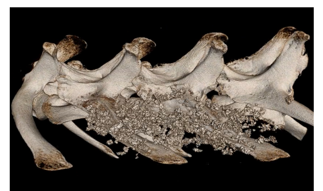
Figure 1. \mu CT 3D reconstruction of lumbar level L4-L5 after 8 weeks (Lateral view, Nikon XTH 225; 17- \mu m res).

Results: Bilateral posterolateral lumbar intertransverse process surgical insertions procedures were performed successfully. All animals maintained good health status and gained weight throughout the 8-week implantation period. Following necropsy, manual palpation showed slightly decreased mobility in the case of the biphasic CaP putty group both in lateral bending and flexion-extension. Also, µCT and Faxitron imaging revealed intertransverse foci that may represent initial ossification in presence of unresorbed biphasic CaP particles (Figures 1 and 2).