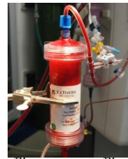
Figure 2. Seraph™ Microbind™ Affinity Blood Filter (ExThera Medical, Berkeley, CA) in series with a dialyzer during a large-animal safety study.

Conclusions: Bacterial removal by the anti-thrombogenic heparin media was much greater for MRSA, which binds to soluble heparin, relative to P. aeruginosa which does not. The (thrombogenic) control media also bound some MRSA non-specifically. A very long list of pathogens and toxins have been reported to bind to soluble heparin and heparan sulfate 1 . This indicates a.) the breadth of adsorbates that may be removed from whole blood by 'immobilized heparin affinity therapy' and b.) its potential utility as a clinical treatment for bacteremia, particularly when caused by drug-resistant organisms, or when no alternative treatments are available.