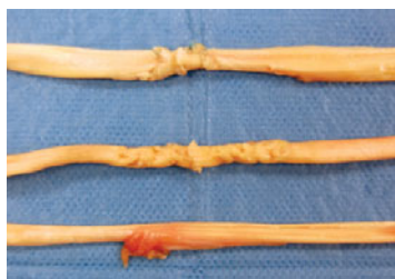
Figure 1. Repair-site profile using 4-core unbarbed cruciate technique (top) and 6-core barbed technique (middle), compared with uninjured tendon (bottom)[4]

Introduction: Barbed surgical sutures are approved by the US Food & Drug Administration for use in plastic and cosmetic surgical procedures [1-3]. The main advantage of the barbed surgical suture is that the barbs project out, penetrate, and anchor with surrounding tissue along the entire suture's length, thus eliminating the need for tying a knot. While this barbed suture technology is widely accepted clinically for skin wound closure, its suitability in other applications, such as tendon repair, has not been accepted [4]. Increasing the tissue anchoring performance generated from the protruding barbs is a key factor to expanding the application of barbed surgical sutures into other fields. The initial objective of the current study was to develop a novel in vitro tendon/suture model for measuring the anchoring performance of barbed sutures in porcine tendon tissue. The second objective was to compare the tendon anchoring performance of nylon 6 with polypropylene (PP) barbed sutures.